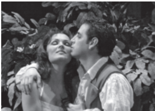
Sutherland and Pavarotti in La Fille du Régiment , Netrebko and Flórez in Don Pasquale .

Scotto and Domingo in a 1980 Manon Lescaut ? Check. Sutherland and Pavarotti in La Fille du Régiment circa 1973? That's there too. Rosa Ponselle in Carmen all the way back in 1937?! Yup.