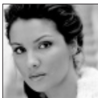
Anna Netrebko SOPRANO (KRASNODAR, RUSSIA)

CAREER HIGHLIGHTS In recent seasons has led Un Ballo in Maschera with the San Francisco Opera; Turandot at Covent Garden; La Rondine at the Paris Opera; Un Ballo in Maschera , La Bohème , and Il Trovatore at the Bavarian State Opera; Don Giovanni in Hamburg; Aida in Berlin; and Manon Lescaut , Il Barbiere di Siviglia , Carmen , and La Traviata at the Vienna State Opera.