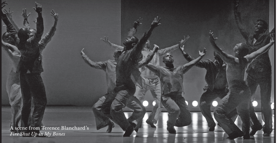
A scene from Terence Blanchard's Fire Shut Up in My Bones

The Metropolitan Opera is pleased to salute Bloomberg Philanthropies in recognition of its generous support during the 2023-24 season.