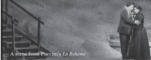
A scene from Puccini's La Bohème

The Metropolitan Opera is pleased to salute Bloomberg Philanthropies in recognition of its generous support during the 2024-25 season.