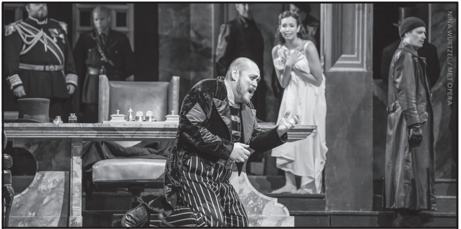
NINA WURZEL / MET OPERA