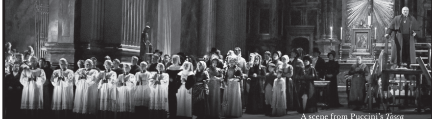
A scene from Puccini's Tosca

The Metropolitan Opera is pleased to salute Rolex in recognition of its generous support during the 2024-25 season.