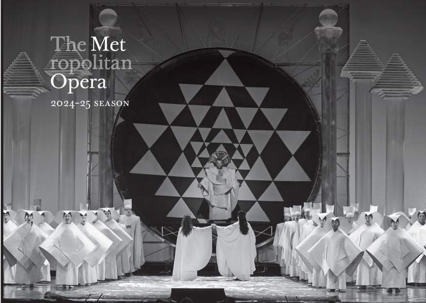
A scene from Mozart's The Magic Flute

The Metropolitan Opera is pleased to salute Pfizer in recognition of its generous support during the 2024-25 season.