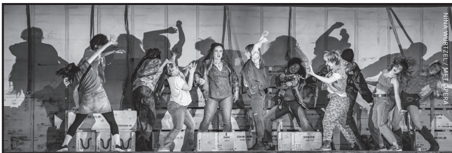
A scene from Bizet's Carmen