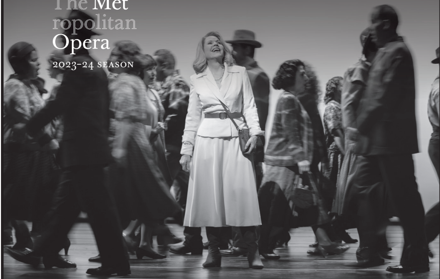
A scene from Kevin Puts's The Hours

The Metropolitan Opera is pleased to salute Bloomberg Philanthropies in recognition of its generous support during the 2023-24 season.