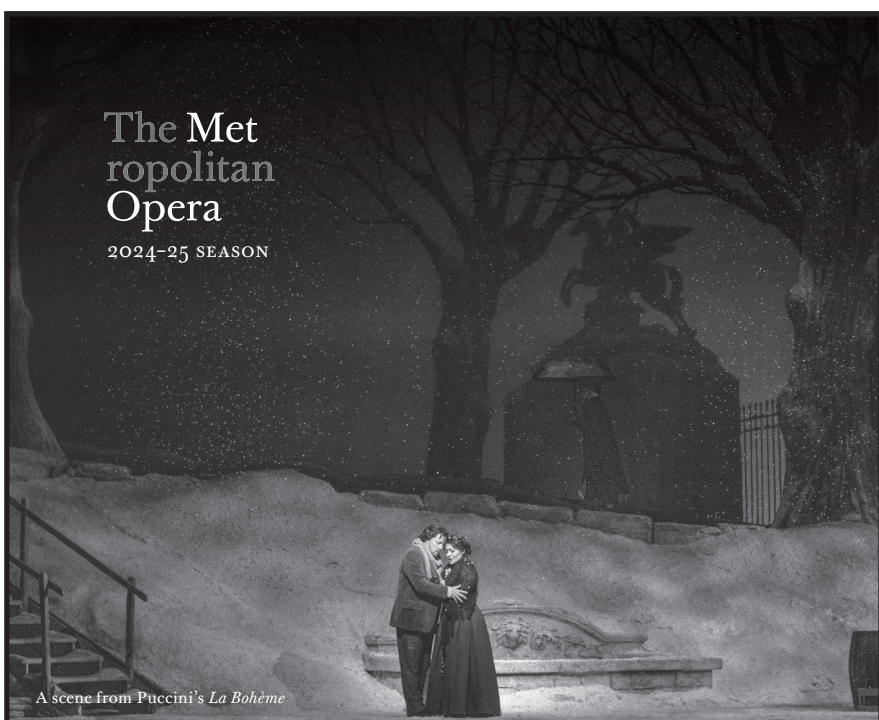
A scene from Puccini's La Bohème

The Metropolitan Opera is pleased to salute Bloomberg Philanthropies in recognition of its generous support during the 2024-25 season.