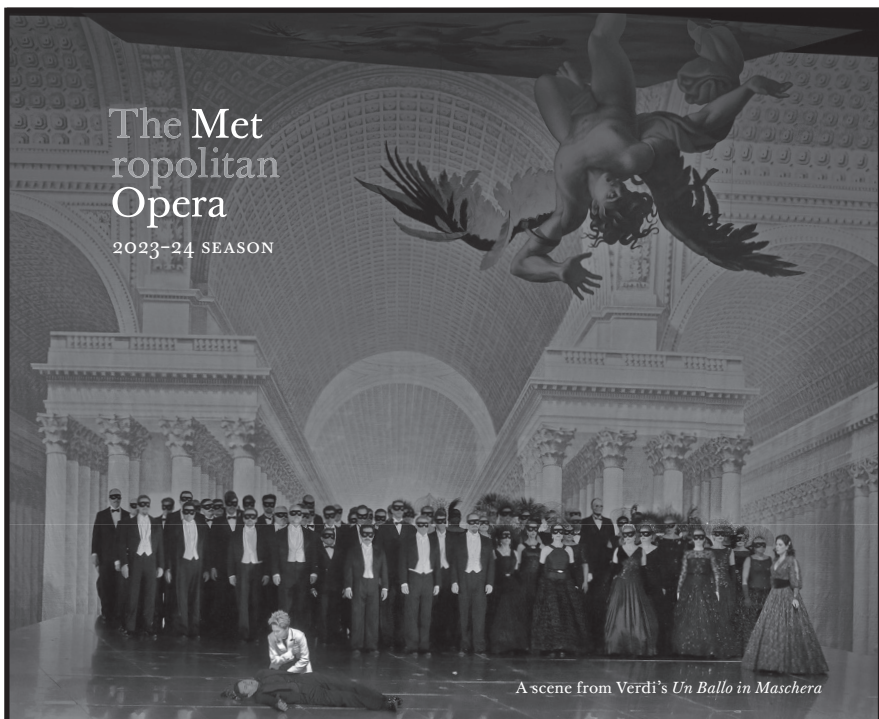
A scene from Verdi's Un Ballo in Maschera

The Metropolitan Opera is pleased to salute Rolex in recognition of its generous support during the 2023-24 season.