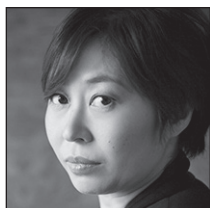
Xian Zhang CONDUCTOR (DANDONG, CHINA)

THIS SEASON Tosca at the Met and concerts with the New Jersey Symphony, Boston Symphony Orchestra, New World Symphony, Philadelphia Orchestra, Los Angeles Philharmonic, Belgian National Orchestra, Seattle Symphony, Montreal Symphony Orchestra, and Baltimore Symphony Orchestra.