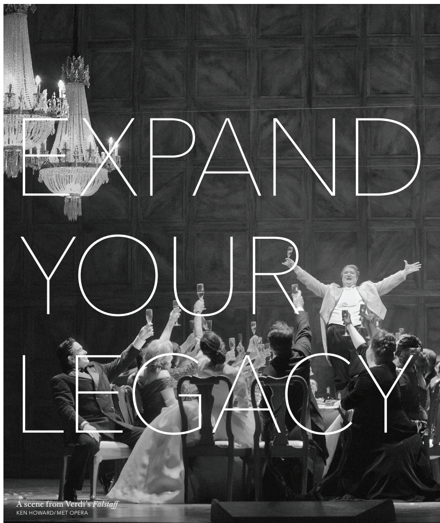
A scene from Verdi's Falstaff

Make a planned gift that's truly grand, and help ensure the future of the art form you love.