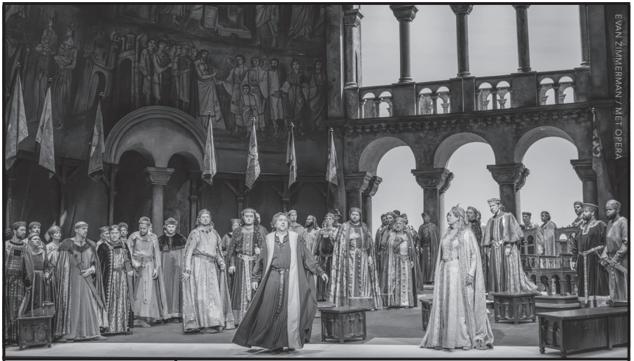
EVAN ZIMMERMAN / MET OPERA