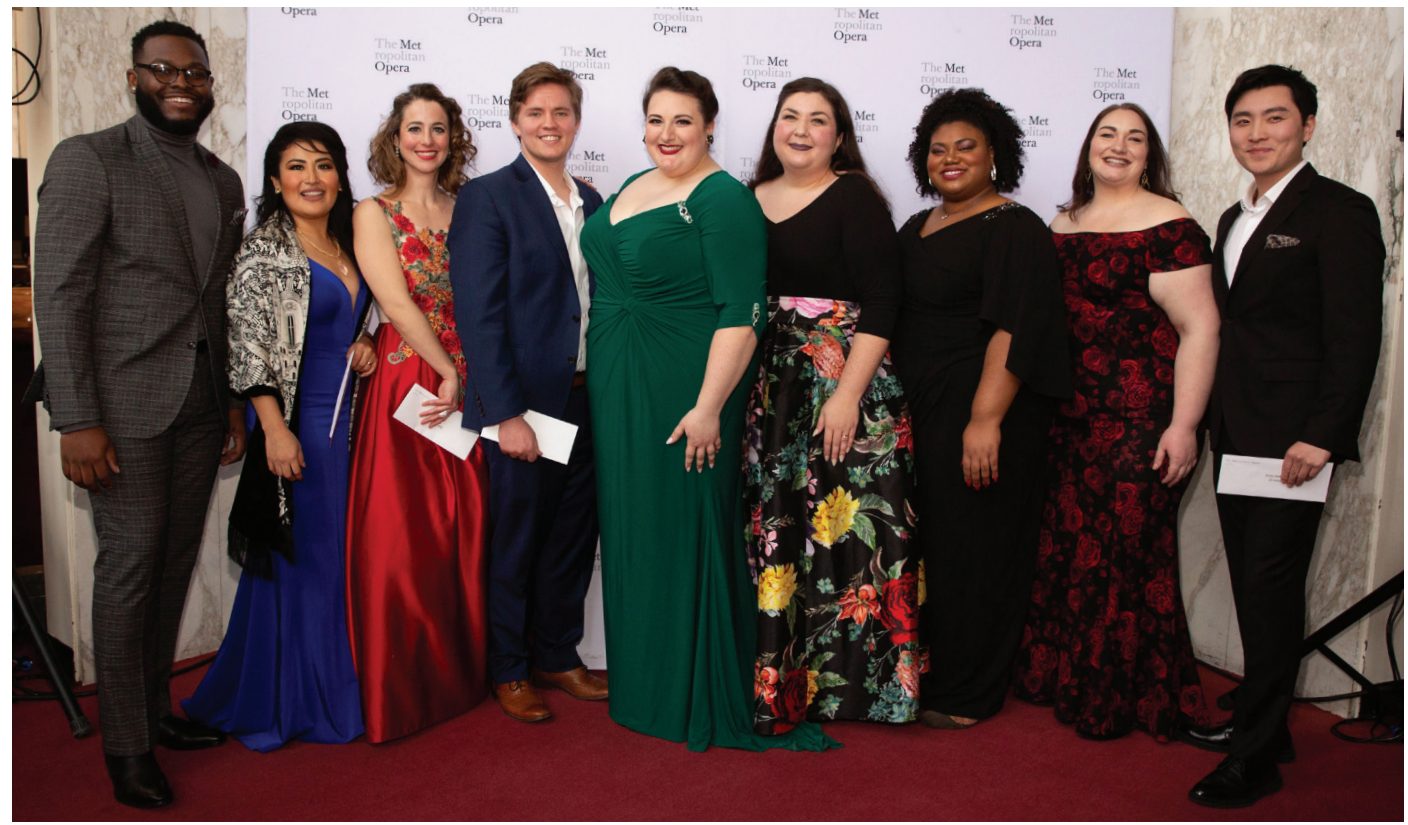
The 2020 National Council Finalists