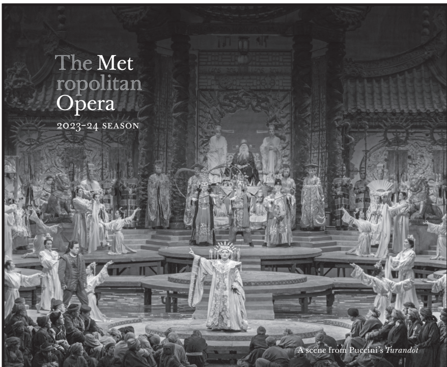
A scene from Puccini's Turandot

The Metropolitan Opera is pleased to salute Mastercard in recognition of its generous support during the 2023-24 season.