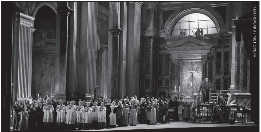
KEN HOWARD / MET OPERA