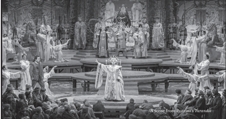
A scene from Puccini's Turandot

The Metropolitan Opera is pleased to salute Mastercard in recognition of its generous support during the 2023-24 season.