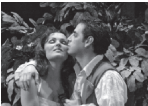
Sutherland and Pavarotti in La Fille du Régiment , Netrebko and Flórez in Don Pasquale .

Scotto and Domingo in a 1980 Manon Lescaut ? Check. Sutherland and Pavarotti in La Fille du Régiment circa 1973? That's there too. Rosa Ponselle in Carmen all the way back in 1937?! Yup.