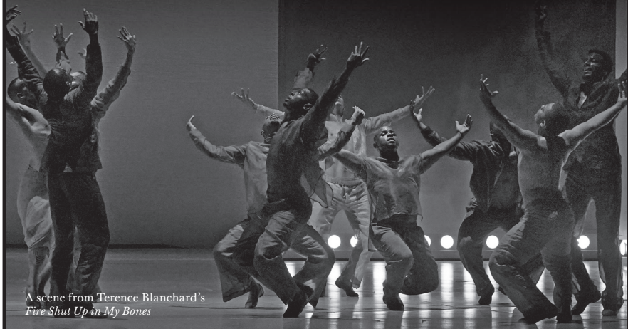
A scene from Terence Blanchard's Fire Shut Up in My Bones

The Metropolitan Opera is pleased to salute Bloomberg Philanthropies in recognition of its generous support during the 2023-24 season.