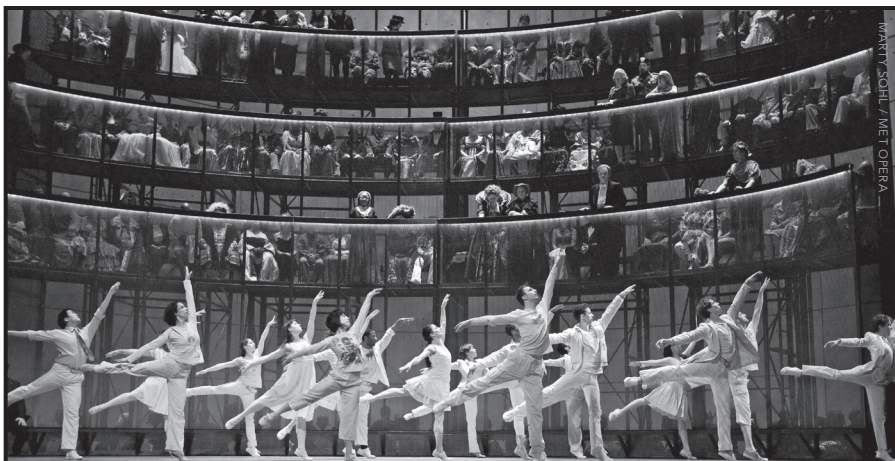
MARTIN SOHL / MET OPERA