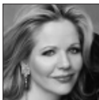
Renée Fleming SOPRANO (INDIANA, PENNSYLVANIA)

THIS SEASON The title roles of Thaïs and Rusalka and the Opening Night Gala at the Met, the Countess in Capriccio with the Vienna State Opera, the title role of Lucrezia Borgia with Washington National Opera, Violetta in La Traviata at Covent Garden, European tours with Orchestre National de France and Orchestre de Paris, and a North American recital tour.