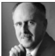
Jesús López-Cobos CONDUCTOR (TORO, SPAIN)

THIS SEASON Thaïs at the Met and Un Ballo in Maschera , Tannhäuser , and Le Nozze di Figaro in Madrid at the Teatro Real.