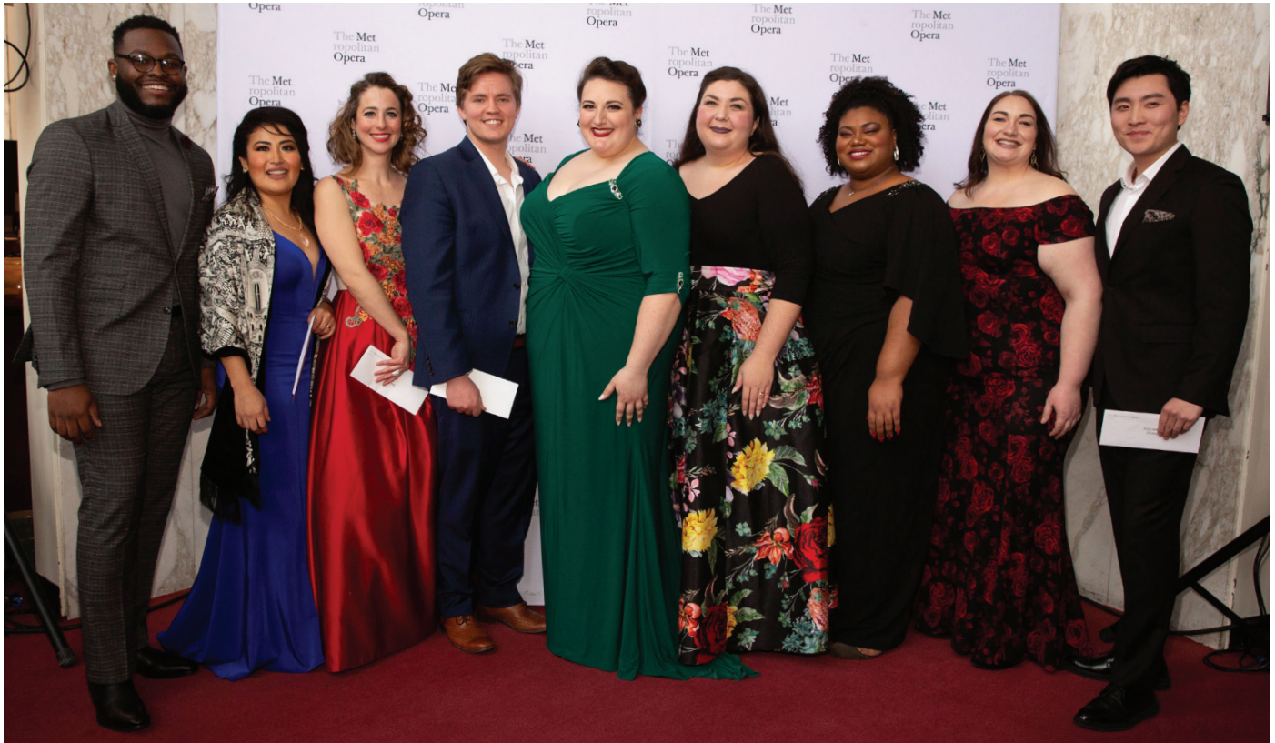
The 2020 National Council Finalists