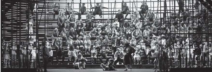
A scene from Bizet's Carmen

The Metropolitan Opera is pleased to salute Bloomberg Philanthropies in recognition of its generous support during the 2023-24 season.