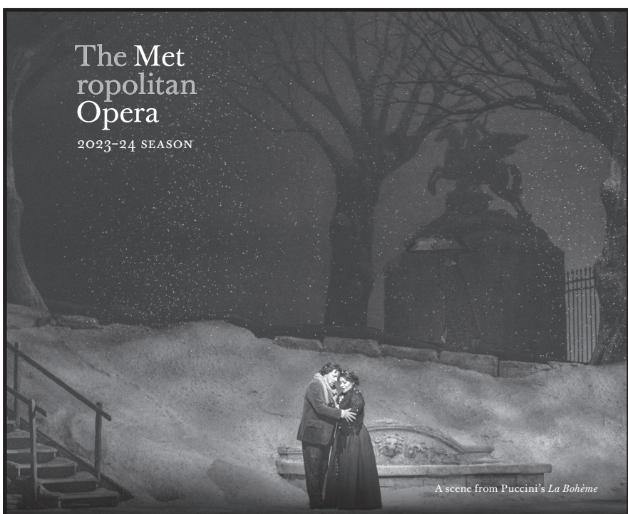
A scene from Puccini's La Bohème

The Metropolitan Opera is pleased to salute Viking in recognition of its generous support during the 2023-24 season.