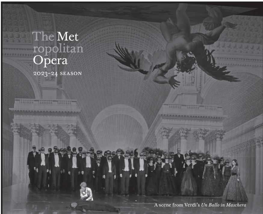
A scene from Verdi's Un Ballo in Maschera

The Metropolitan Opera is pleased to salute Rolex in recognition of its generous support during the 2023-24 season.