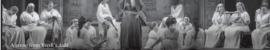
A scene from Verdi's Aida

The Metropolitan Opera is pleased to salute Bloomberg Philanthropies in recognition of its generous support during the 2024-25 season.