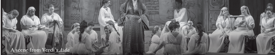
A scene from Verdi's Aida

The Metropolitan Opera is pleased to salute Bloomberg Philanthropies in recognition of its generous support during the 2024-25 season.