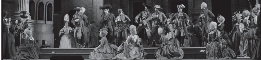
A scene from Gounod's Roméo et Juliette

The Metropolitan Opera is pleased to salute Rolex in recognition of its generous support during the 2023-24 season.