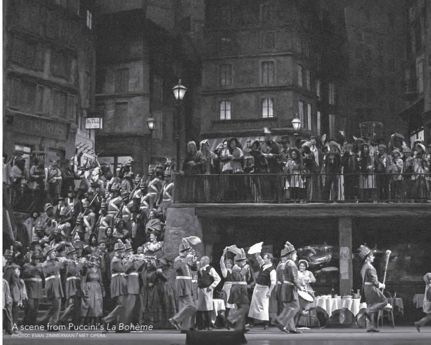
A scene from Puccini's La Bohème

Make a planned gift to help bring opera to the world.