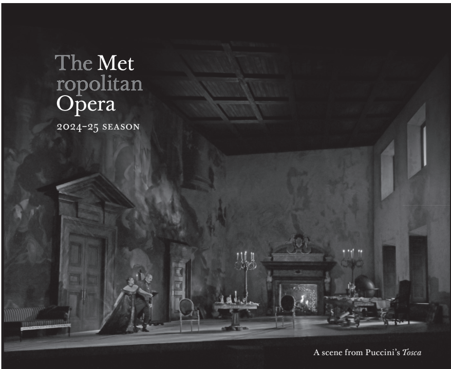
A scene from Puccini's Tosca

The Metropolitan Opera is pleased to salute Mastercard in recognition of its generous support during the 2024-25 season.