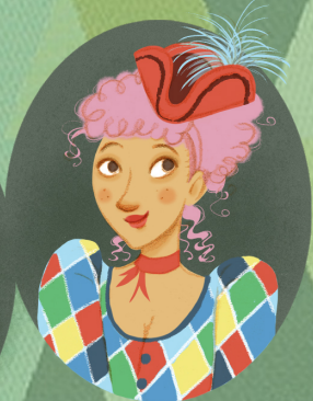
Zerbinetta Comedienne and leader of the burlesque group