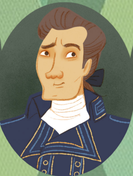
The Tenor/ Bacchus Male lead of the Composer's opera