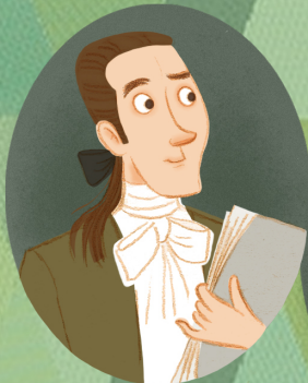
The Composer Writer of the opera