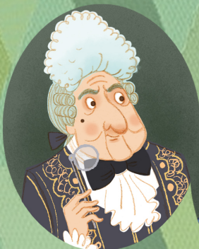
The Major-Domo Head of the household of the wealthiest man in Vienna