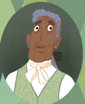
The Music Master The Composer's teacher