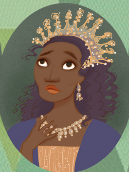
The Soprano/ Ariadne Star of the Composer's opera