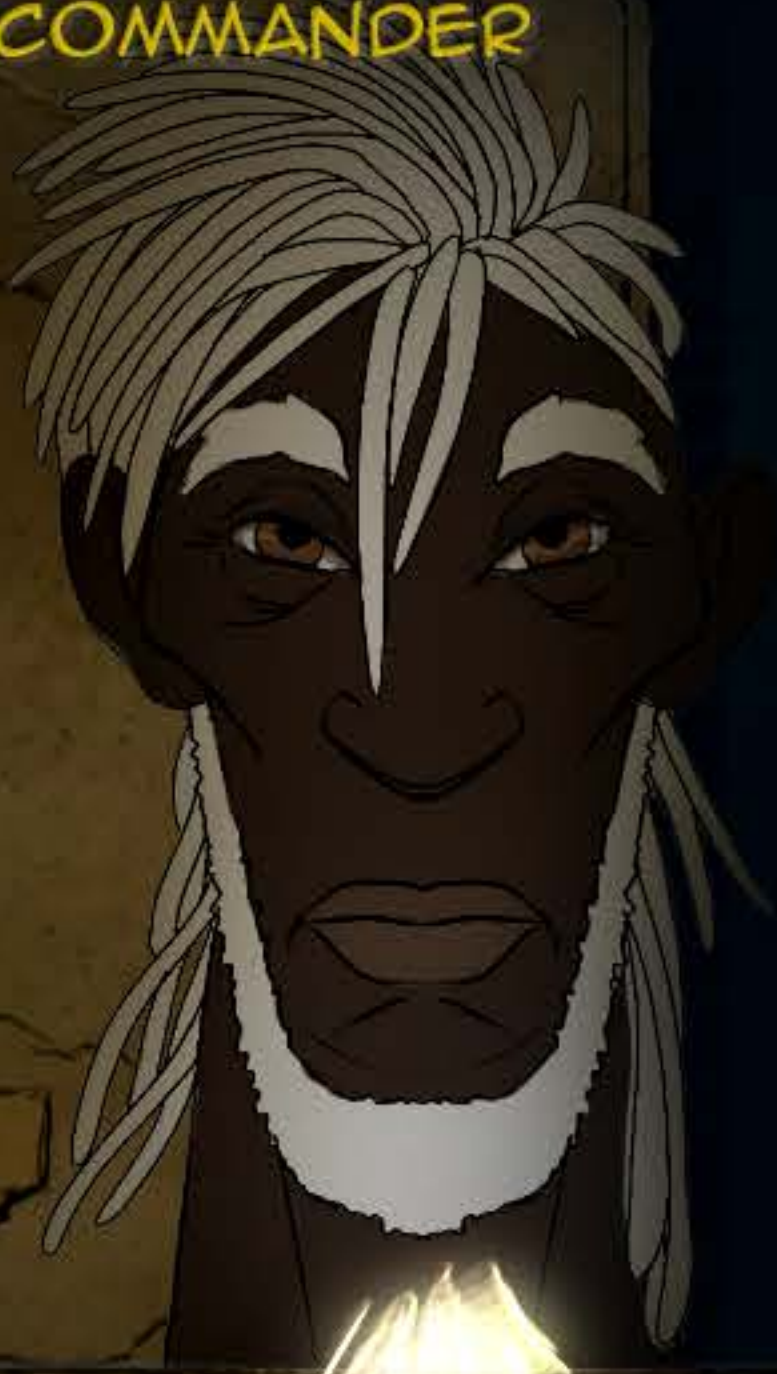
AMONASRO, KING OF ETHIOPIA