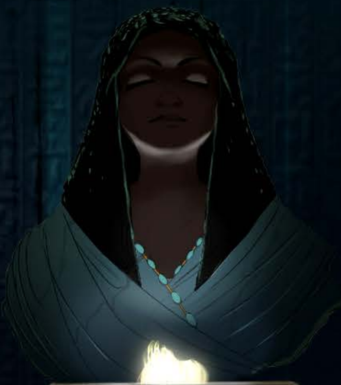
AIDA, PRINCESS OF ETHIOPIA