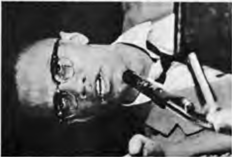
MALCOLM X FOUNDER OF THE O.A.U.

ORGANIZATION OF AFRO-AMERICAN UNITY INC.